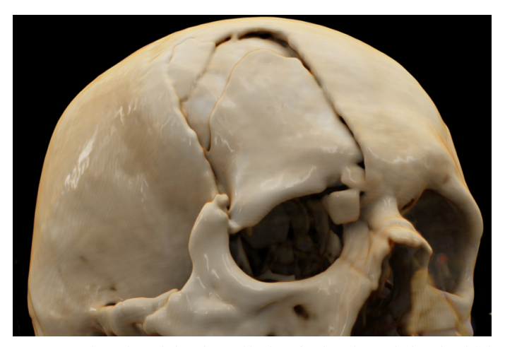
Figure 3. In cinematic rendering, the combination of path-tracing methods and a global illumination model allows a lifelike display of the affected area