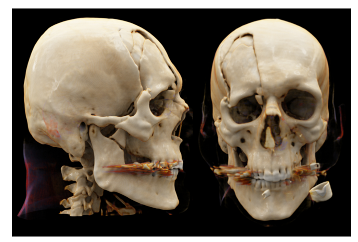
Figure 4. The combination of photorealistic display and a clear depiction of the entire anatomical region increases pathology conspicuity

case above a radiologist needs at least two different plains while a threedimensional rendering can provide that information in just one or only few pictures (Figure 4) [4,7].