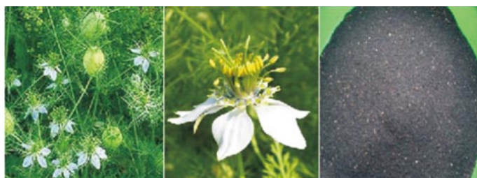
Figure 1. Photographs of the Nigella sativa plant, flower and seeds. This figure was reproduced from Ahmad, et al. [1] publication on the basis of noncommercial license

Recently reviewed preclinical studies disclosed that NS possesses broad pharmacological actions which include: anti-cancer, anti-diabetic, anti-inflammatory, analgesic, anti-convulsant, anti-microbial, anti-hyperlipidemic, anti-asthmatic and anti-hypertensive properties [1,2]. Its mode of action is mediated by anti-oxidant, immunomodulating, cytoprotective and inhibitory effects on mediators of inflammation [2]. N. sativa also inhibits tumor cell proliferation through modulation of apoptosis signaling, the inhibition of angiogenesis and cell cycle arrest [3].