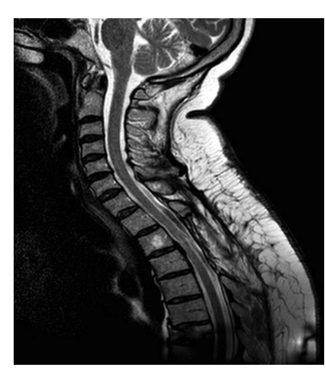
Figure 2. At 2-year follow-up, there has been no evidence of recurrent disease.

found that 80% of desmoid tumors occur in females, 50% of them in the third to fifth decade of life.