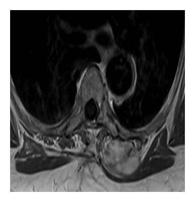
Figure 1. Magnetic resonance imaging (MRI) revealed a T2 hyperintense mass within the right subcutaneous tissues and paraspinal muscles at the T1–T3 levels.

Correspondence to: R. Rispoli, Department of Neurosurgery, "S.Maria" Hospital-Terni, Italy; E-mail: rossella.rispoli@libero.it